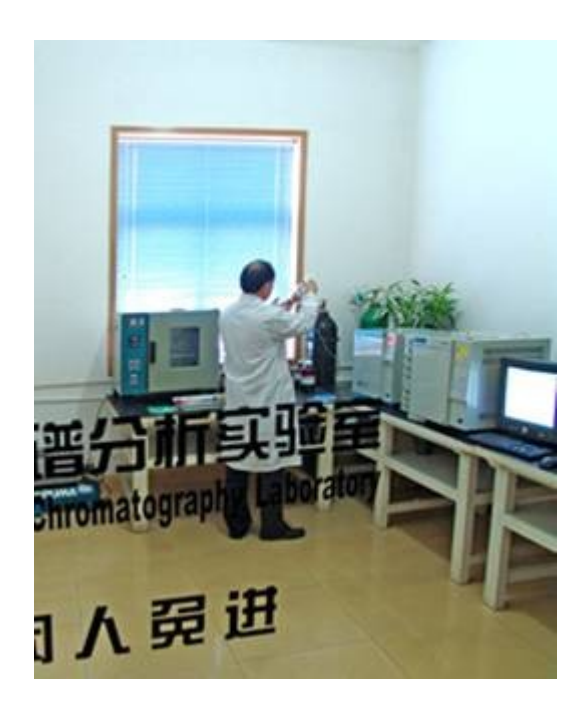
Figure 3. Chromatographic Analysis Lab

analysis method, data test, and staff training on solvent residue controlling of package materials. Labthink GC-6890 and GC-7800 special gas chromatographic instrument for solvent residue test of complex package can provide test for commission service to customers. It can also perform data comparison of several labs. In the future, this lab will also carry out thorough and careful research of global advanced research subjects on permeation principle of organic gases in polymer, on selective controlling and test.